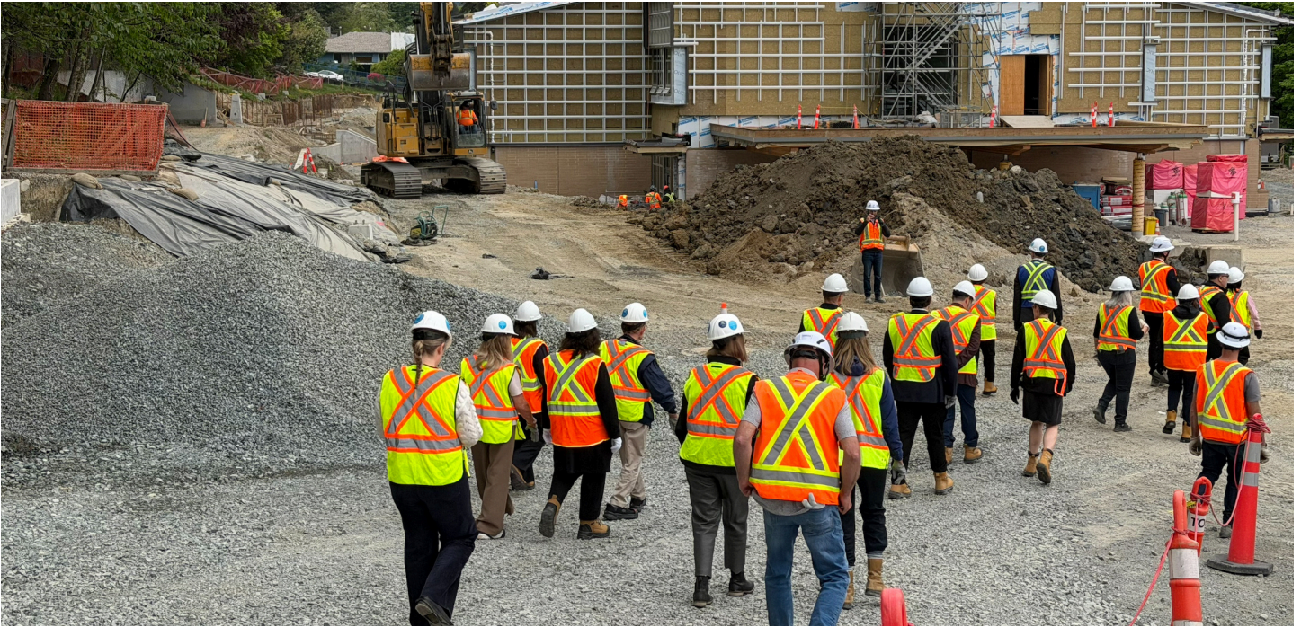
On May 6, 2026, City of North Vancouver Mayor and Council joined the North Vancouver Board of Education for a site visit to the Cloverley. Read more on page 4.